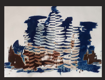
Jock River Ferns, Cyanotype/Van Dyke brown. Original monotype print 1/1 18" x 24"