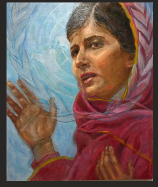
Speak Up (Malala Yousafzai), oil on canvas, 36 x 30 in.