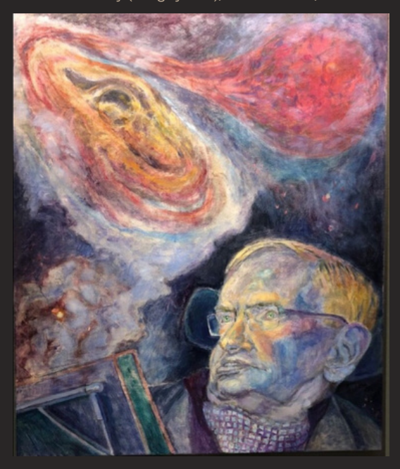
Mind Travel (Stephen Hawking), oil on canvas, 36 x 30 in.