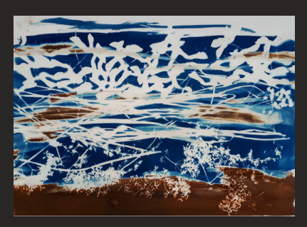
"Jock River 2" July 2020. Gyanotype/Van Dyke brown. Original monotype print 1/1 30" x 22"