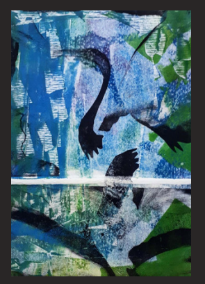
"Flight or Fight" Heron at Riverside, Print Monotype 1/1 16.5" X 13.5" inches