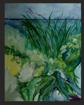
"Riverbank" Rideau River, Acrylic, 14" x 18.