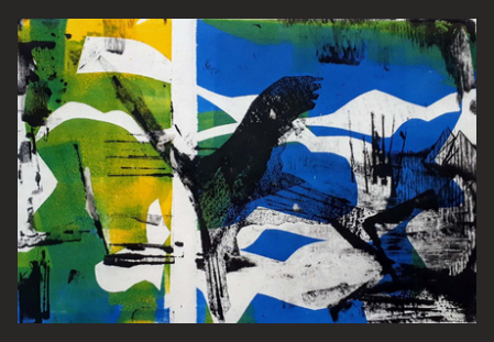
"Escape" Heron at Riverside, Print Monotype 1/1, 13.5" X 16.5" inches 2016