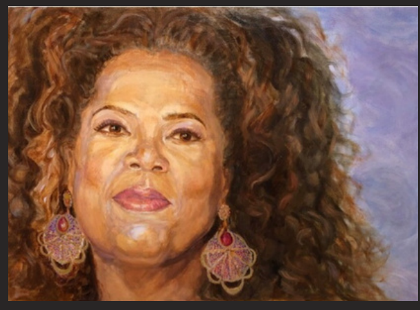
Turn Your Wounds into Gems (Oprah Winfrey), oil on canvas, 18 x 24 in