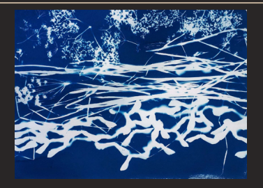
"Jock River" July 2020.Cyanotype Original monotype print 1/1 25" x