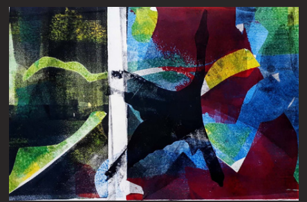
"Stratosphere" Heron at Riverside, Print Monotype 1/1 13.5" X 16.5" inches.