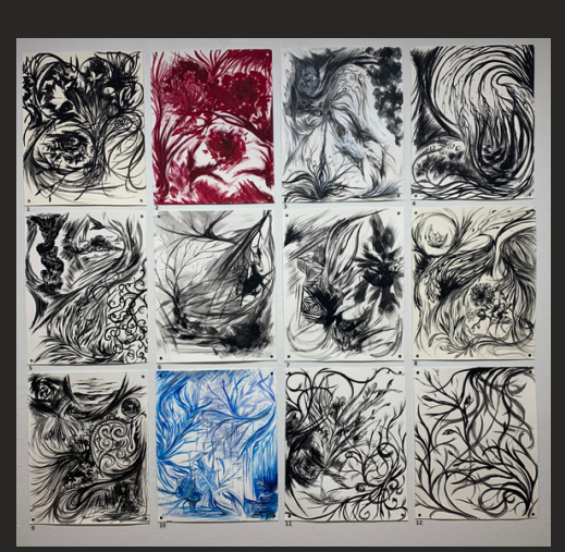
Body of 12 Paintings, Acrylic on Watercolour paper, 16" x 20", 2020

First Row Swirled Shadows Ember Dusk Illumines Dream Unseen Path